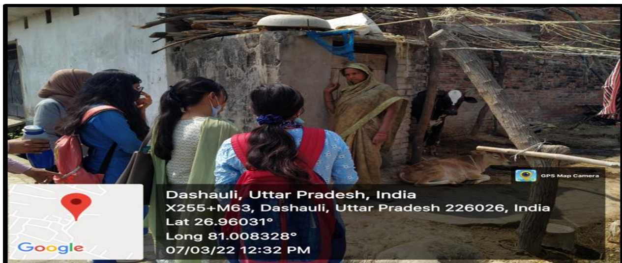
Faculty members and students spreading health awareness in villages in the suburb of Integral University