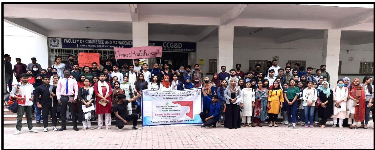
Faculty Members and students of the department of commerce and business management assembled outside BNLT block